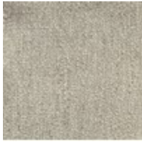
Body Fabric: 2875-35CC-P Performance, Decorative Trim on Frame U00461 Pillow Fabric: 2-20" x 20" Pillows 6125-93CC