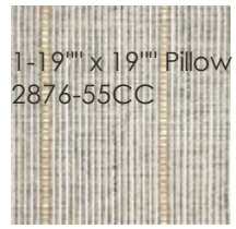
1-19" x 19" Pillow 2876-55CC

Body Fabric: 2875- 35CC-P Performance, Decorative Trim on Frame U00461 Pillow Fabric: 2-20" x 20" Pillows 6125-93CC