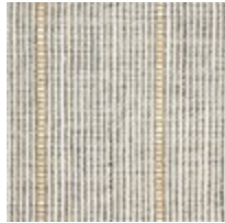
1-19" x 19" Pillow 2876-55CC