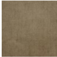
1-19" x 19" Pillow 2877-92CC