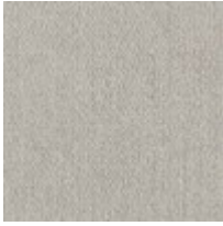
Body Fabric: Inside 2851-92CC-P Performance, Outside under metal framework 3248- 87CC