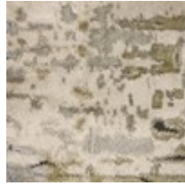
Pillow Fabric: 1-20" x 20" Pillow 8414-17CC