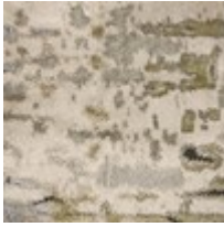
Body Fabric: 8414-17CC