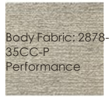
Body Fabric: 2878-35CC-P Performance