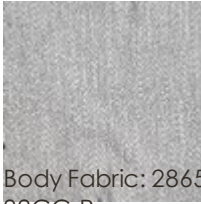
Body Fabric: 2865- 92CC-P Performance