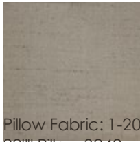
Pillow Fabric: 1-20''' x 20''' Pillow 3249- 92CC