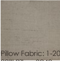
Pillow Fabric: 1-20''' x 20''' Pillow 3249- 92CC