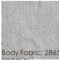
Body Fabric: 2865- 92CC-P Performance