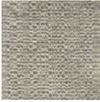
Body Fabric: 2864- 35CC-P Performance, Contrast Underskirt 3233-92CC