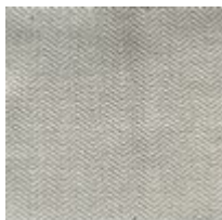
Body Fabric: 2866-34CC-P