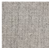
Pillow Fabric: 2-20''' x 20''' Pillows 2867-