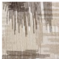
2-20''' x 20''' Pillows 8416-35CC