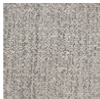
Pillow Fabric: 2-20''' x 20''' Pillows 2867-