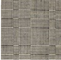
Body Fabric: 2813-91CC