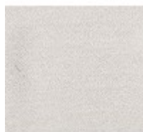
1-19''' x 19''' Pillow 3230-88CC-P