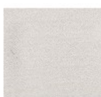
1-19''' x 19''' Pillow 3230-88CC-P