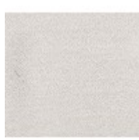
1-19''' x 19''' Pillow 3230-88CC-P