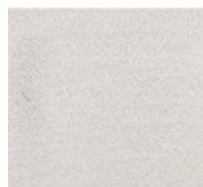
1-19''' x 19''' Pillow 3230-88CC-P