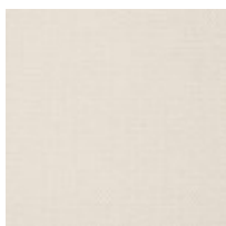
Body Fabric: 2779-34CC