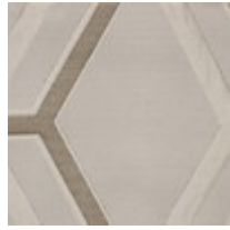
Pillow Fabric: 2- 20" x 20" Pillows 8379-71CC