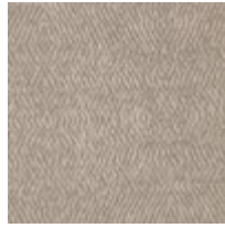
2-19" x 19" Pillows 3231- 741CC