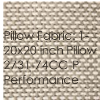
Pillow Fabric: 1-20x20 inch Pillow 2731-74CC-P Performance