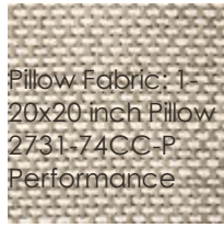
Pillow Fabric: 1-20x20 inch Pillow 2731-74CC-P Performance