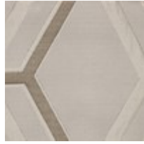
Pillow Fabric: 2- 20" x 20" Pillows 8379-71CC