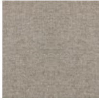
Body Fabric: 2778-71CC