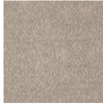
2-19" x 19" Pillows 3231- 741CC