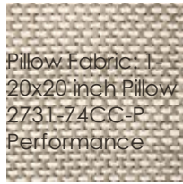
Pillow Fabric: 1-20x20 inch Pillow 2731-74CC-P Performance