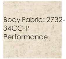
Body Fabric: 2732-34CC-P Performance