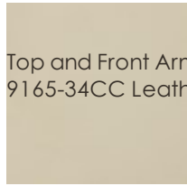
Top and Front Arm 9165-34CC Leather