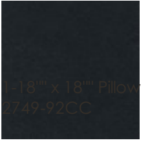
18" x 18" Pillow 2749-92CC