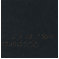
18" x 18" Pillow 2749-92CC