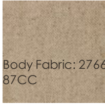
Body Fabric: 2766-87CC