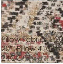
Pillow Fabric: 1-20" x 20" Pillow 410-24CC