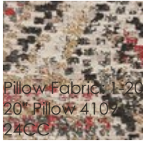
Pillow Fabric: 1-20" x 20" Pillow 4104-24CC