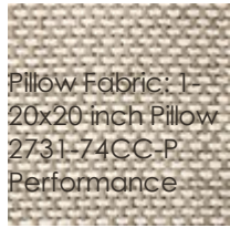
Pillow Fabric: 1-20x20 inch Pillow 2731-74CC-P Performance