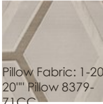
Pillow Fabric: 1-20" x 20" Pillow 8379-71CC