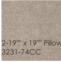
2-19" x 19" Pillows 3231-74CC