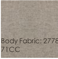
Body Fabric: 2778-71CC