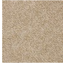
Pillow Fabric: 1-20 mm x 20 mm Pillow 2769-35CC