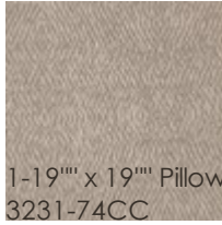
1-19" x 19" Pillow 3231-74CC