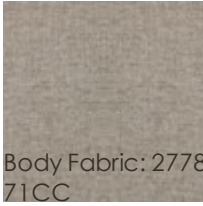
Body Fabric: 2778-71CC