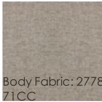
Body Fabric: 2778-71CC