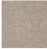
1-19''' x 19''' Pillow 3231-74CC