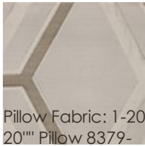
Pillow Fabric: 1-20''' x 20''' Pillow 8379-71CC