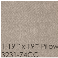
1-19''' x 19''' Pillow 3231-74CC