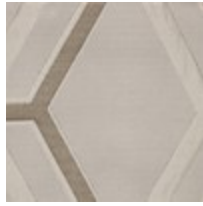
Pillow Fabric: 1-20''' x 20''' Pillow 8379-71CC