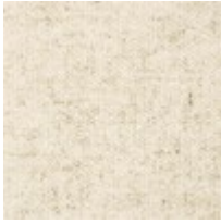
Body Fabric: 2732- 34CC-P Performance