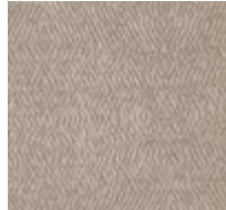
Pillow Fabric: 1-22''' x 19''' Pillow 3231- 74CC