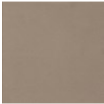
Body Fabric: 2872- 91CC, Arm Pads and Body and Seat Cushion Welt 9133- 71CC Leather