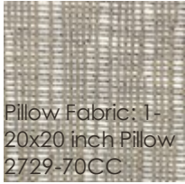
Pillow Fabric: 1-20x20 inch Pillow 2729-70CC