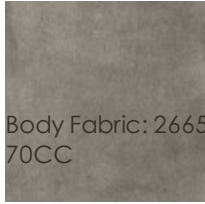
Body Fabric: 2665-70CC