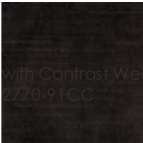
with Contrast Weft 2770-91CC