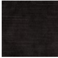
with Contrast Welt 2770-91CC