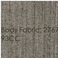
Body Fabric: 2767-93CC