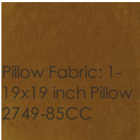
Pillow Fabric: 1-19x19 inch Pillow 2749-85CC