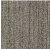
Body Fabric: 2767-93CC