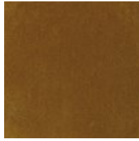
Pillow Fabric: 1- 19x19 inch Pillow 2749-85CC