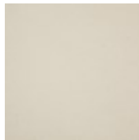
1-19" x 19" Pillow 2832-34CC

Pillow Fabric: 2-21" x 21" Pillows 2831- 71CC