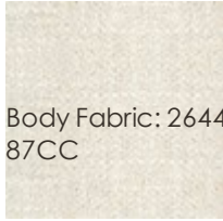
Body Fabric: 2644-87CC