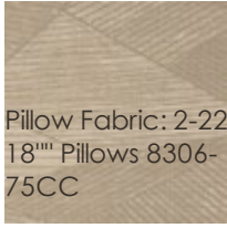
Pillow Fabric: 2-22\"/>