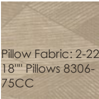
Pillow Fabric: 2-22''' x 18''' Pillows 8306-75CC