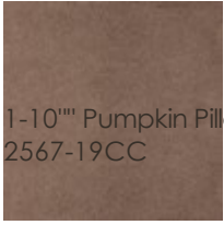
1-10" Pumpkin Pillow 2567-19CC