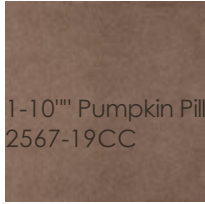
1-10" Pumpkin Pillow 2567-19CC