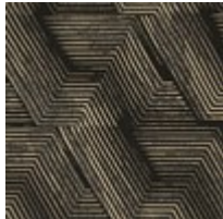
Body Fabric: Inside 2643- 78CC, Outside 8317-78CC