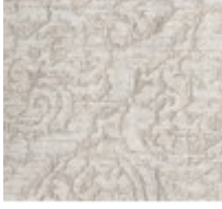
Body Fabric: Outarm, Outback 5085-42CC