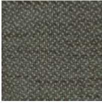
Body Fabric: 2659-13CC