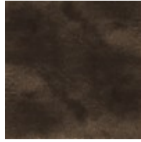
1-22" x 14" Pillow 8307- 78CC