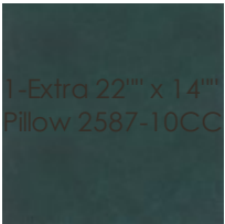
1-Extra 22''' x 14''' Pillow 2587-10CC