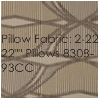
Pillow Fabric: 2-22''' x 22''' Pillows 8308-93CC