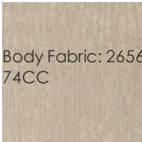
Body Fabric: 2656-74CC