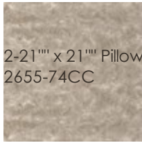
2-21" x 21" Pillows 2655-74CC