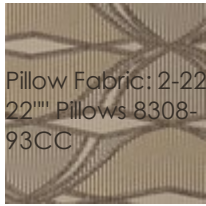
Pillow Fabric: 2-22" x 22" Pillows 8308-93CC