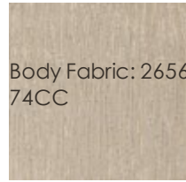
Body Fabric: 2656-74CC