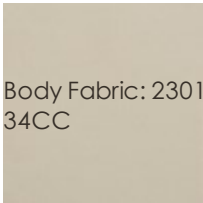
Body Fabric: 2301-34CC