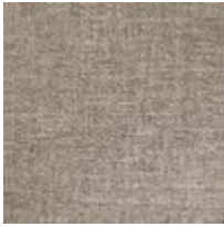
Body Fabric: 2570-93CC