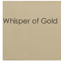
Whisper of Gold