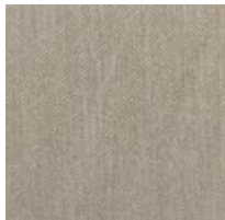
Body Fabric: 2493-71CC