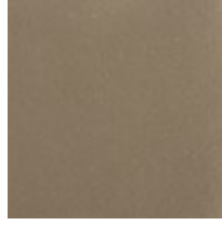
Pillow Fabric: 2- Roll Bolsters 2536-34CC