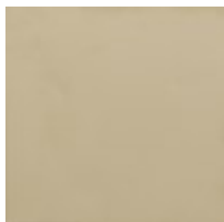
Whisper of Gold