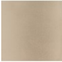
Ombre Warm Silverleaf