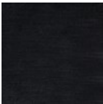
Body Fabric: 2433-90CC