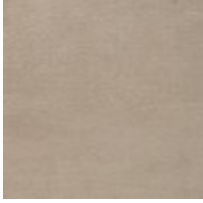
Body Fabric: 2432-35CC