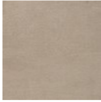
Body Fabric: 2432-35CC