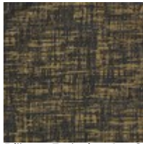
Pillow Fabric: 1 - 22" x 14" Kidney Pillow 2541-12CC with Contrast Welt 2538- 12CC