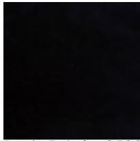
Body Fabric: 2538- 12CC