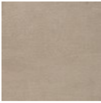
Body Fabric: 2432-35CC