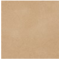
Body: 9183-82CC Leather