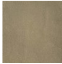
Middle Fold—2788- 77CC-P Performance