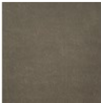
Bottom Fold--2788-85CC-P Performance