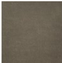
Body Fabric: Top Rail--2788-85CC-P Performance