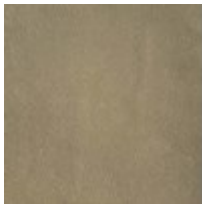
Middle Fold--2788-77CC-P Performance