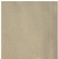
Top Fold--2788-34CC-P Performance