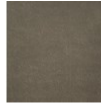
Bottom Fold—2788- 85CC-P Performance