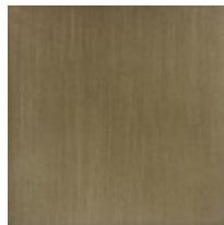
Bronze Plated Metal