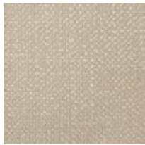
Body Fabric: 2585-71CC