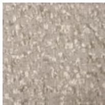
Body Fabric: Inside Body and Welt 2585- 71CC