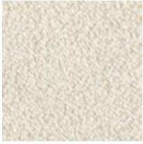
Body fabric: 2976- 87CC-P Performance