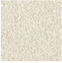
Body fabric: 2976- 87CC-P Performance