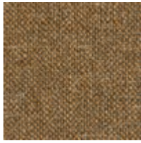
Body fabric: 2987- 30CC