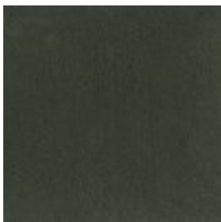
Body Fabric: 2997-56CC