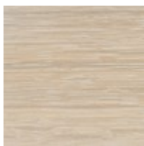
Sun Drenched Oak