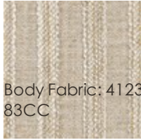
Body Fabric: 4123- 83CC