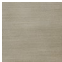
Smoked Stainless Steel paint